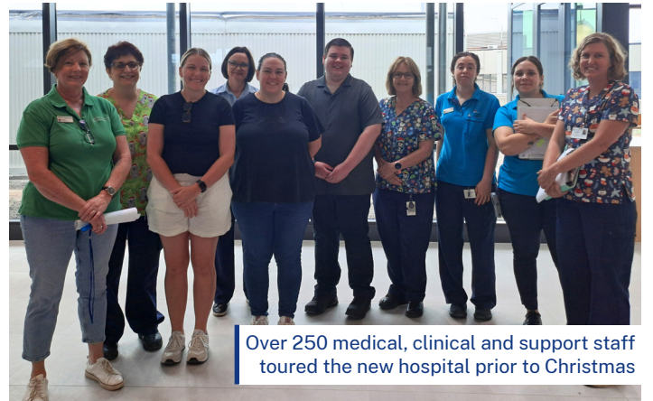
Over 250 medical, clinical and support staff toured the new hospital prior to Christmas

We have planned for our staff, patients and community to settle into the new building before bringing additional services online or increasing the capacity of existing