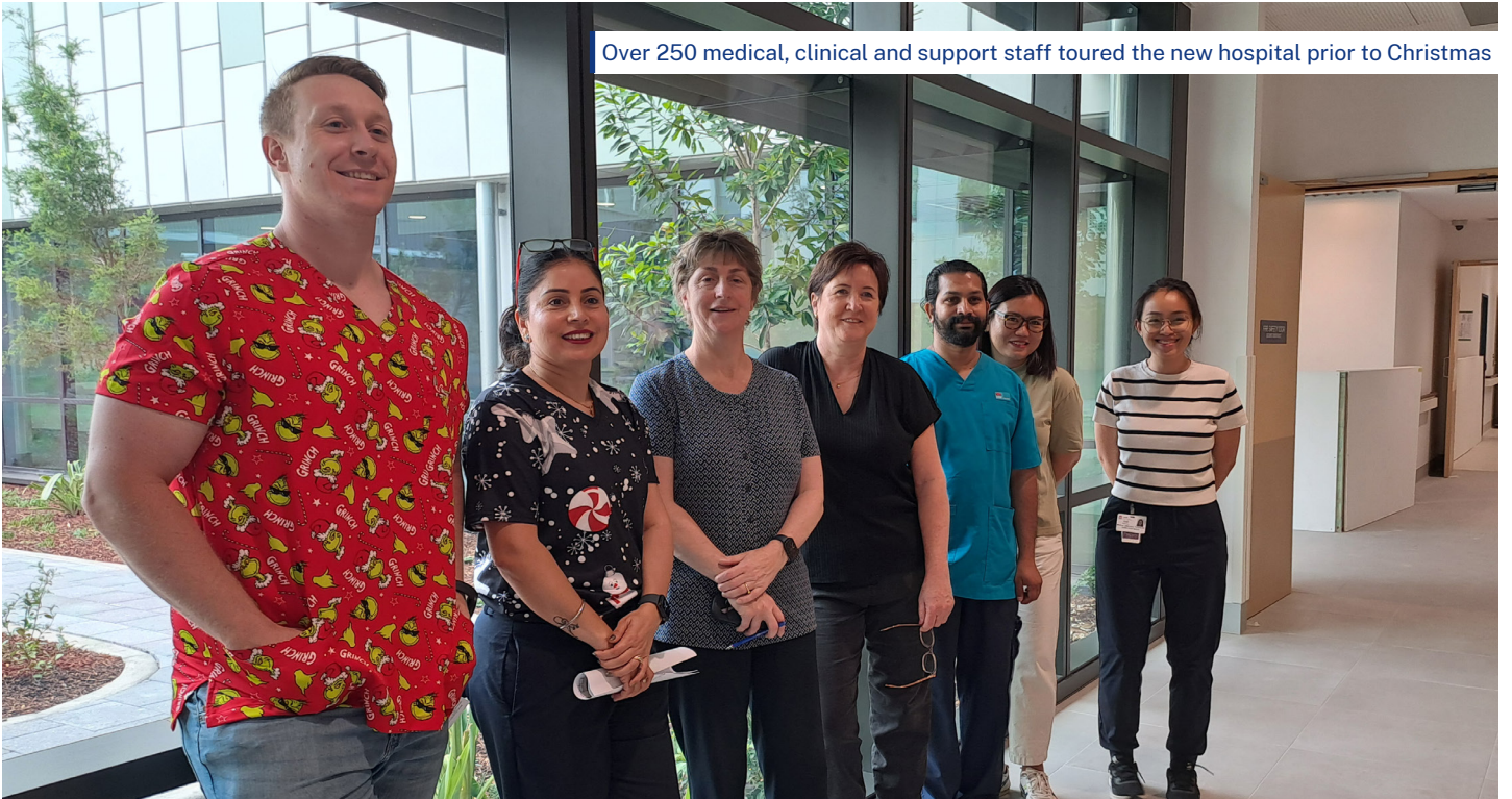
Over 250 medical, clinical and support staff toured the new hospital prior to Christmas