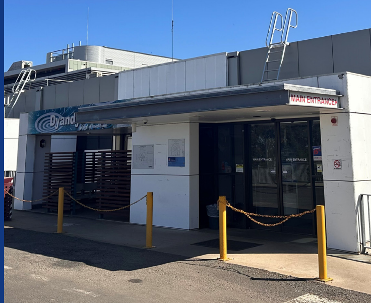
Existing hospital main entry

Ambulance and emergency service vehicle entry to the hospital will be via Warrambool St.