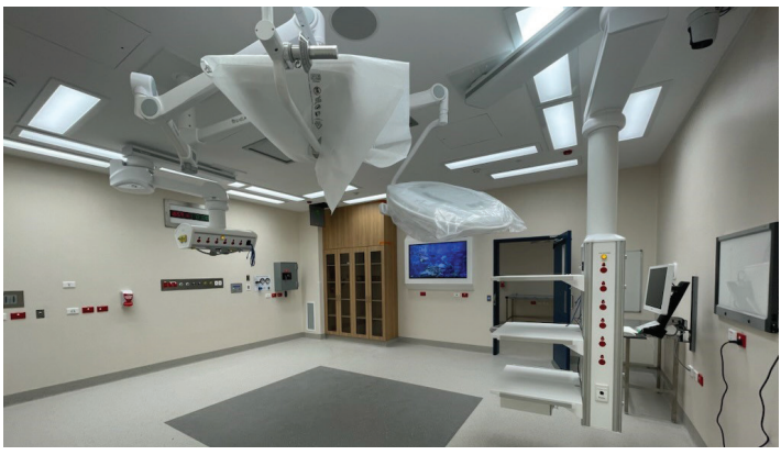
The new hospital includes two digital operating theatres, one procedure room and an expanded day surgery

The new building and location of the perioperative theatre was designed to significantly improve patient flow and experience, according to Peta McIntyre, MLHD Perioperative Network Manager.