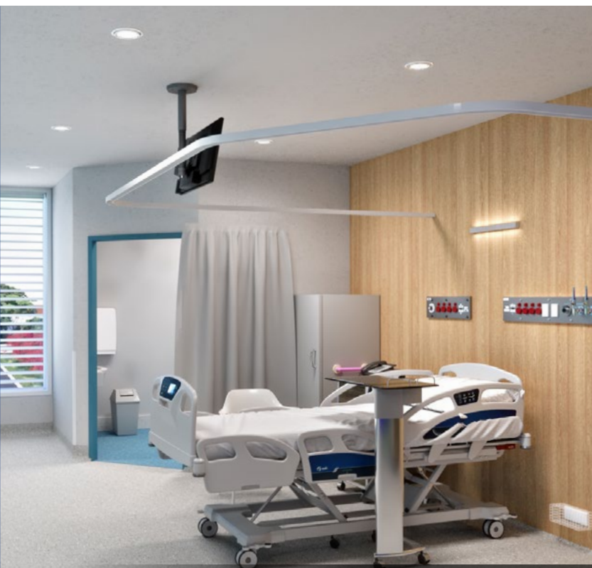
Artist impression of inpatient room

Yes, expanded onsite car parking is included in the planning for the redeveloped Hospital campus. A temporary car park was completed during the early and enabling works in 2021 to ensure current car parking numbers are maintained during the construction phase.