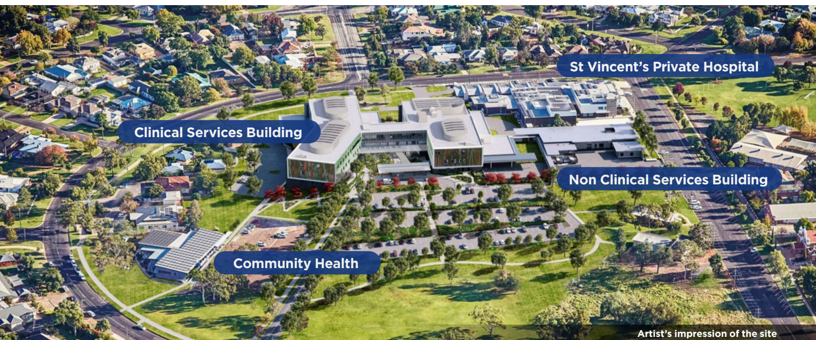
Artist's impression of the site